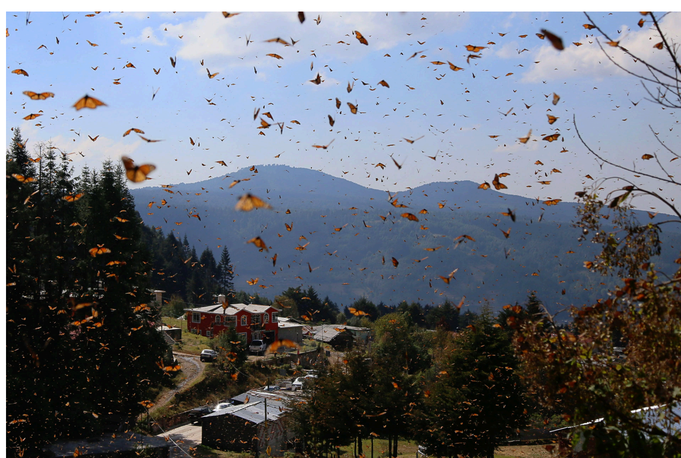
FLUTTER SPEED MEETS SHUTTER SPEED Monarch butterflies fill the air around on the mountaintops in the Monarch Butterfly Biosphere Reserve, a UNESCO World Heritage Site in Michoacán, Mexico.

The migratory monarch butterfly, a subspecies of the monarch butterfly, was recently added to the IUCN's Red List as an endangered species, due to pressures from habitat loss and climate change.